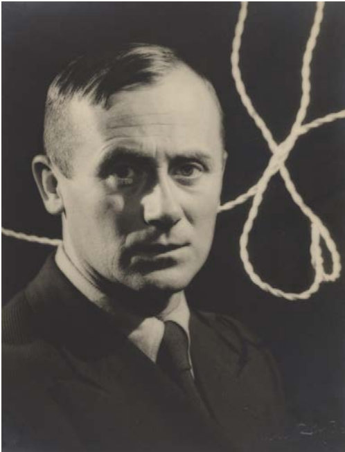
Miró, 1936

Fundació Joan Miró , the Joan Miro Foundation, Barcelona: center for study, art collection; biography, artwork, publications.